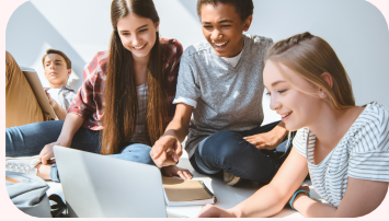
Student Digital Masterclass