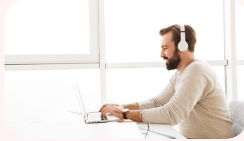
Teacher Professional Learning Seminar